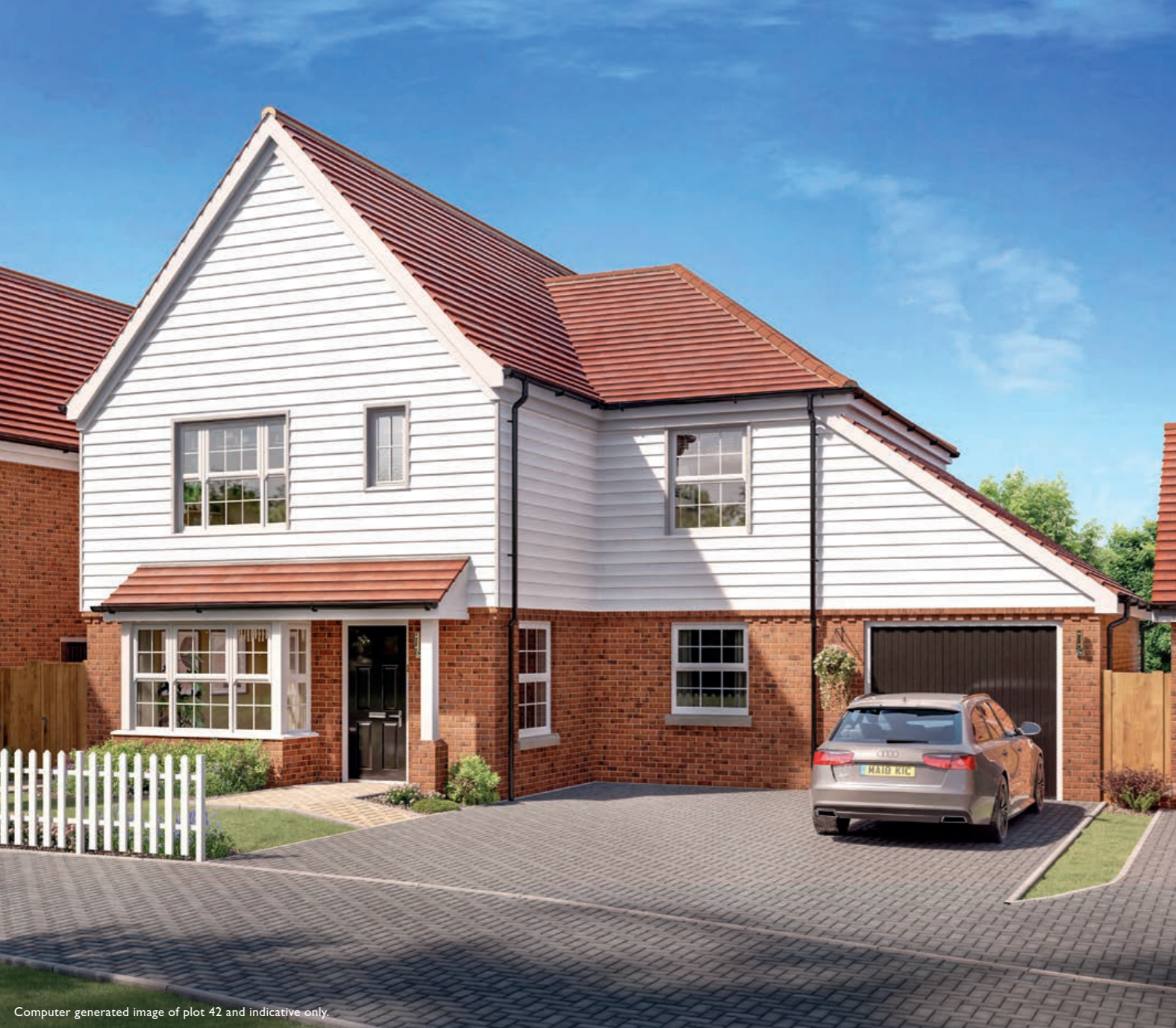
Computer generated image of plot 42 and indicative only.